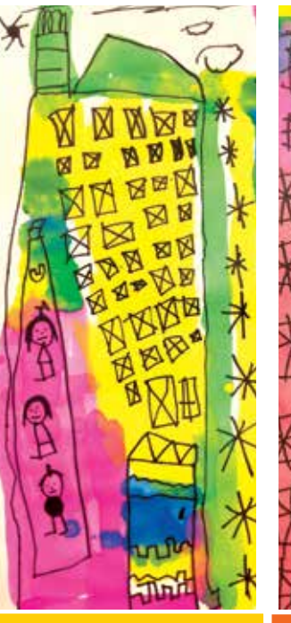
ECHO PARK 1841 PARK AVE.