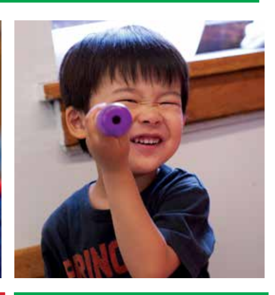
HEALTH AND PHYSICAL DEVELOPMENT