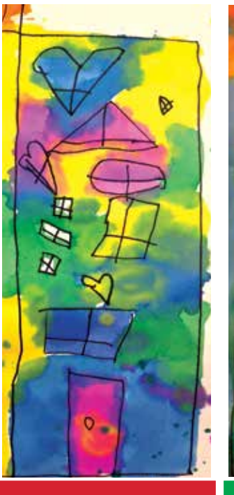
MERRICAT'S CASTLE 316 EAST 88TH ST