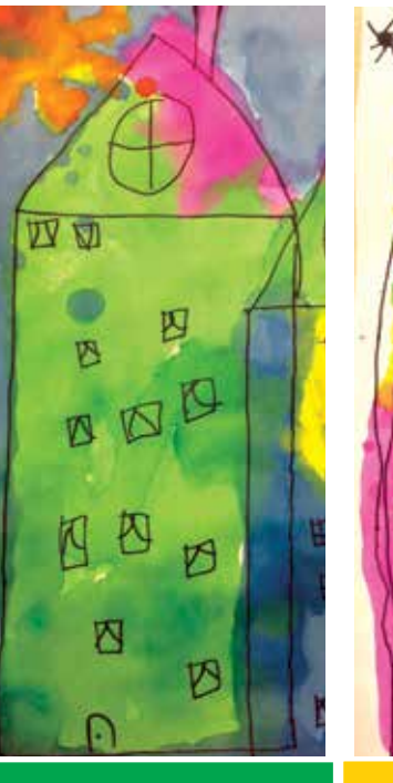
CODY GIFFORD HOUSE 404 EAST 91ST SUPPORTIVE HOUSING/ KEITH HARING SCHOOL 318 EAST 116TH ST